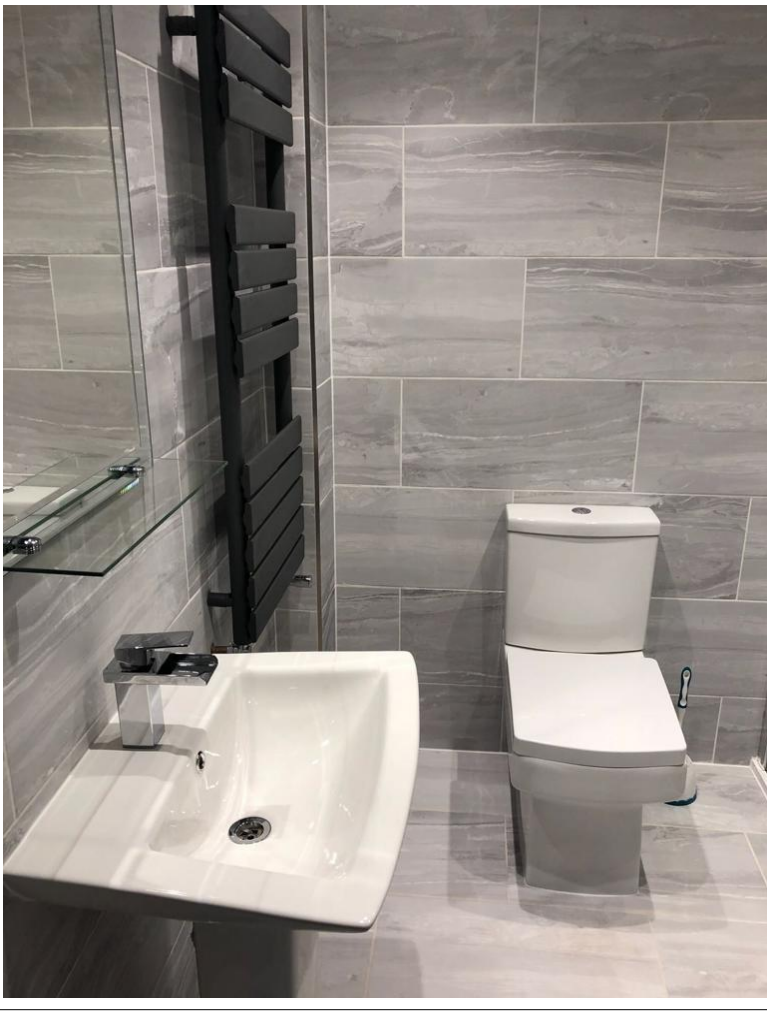
www.bettesworths.co.uk 29/30 Fleet Street Torquay Devon TQ1 1BB