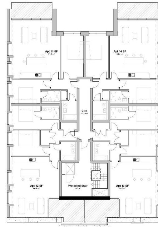
Second Floor - Plan 1:100

Interested in this property? T.01803 21 20 21 bettesworths.co.uk